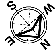
Site Analysis Legend